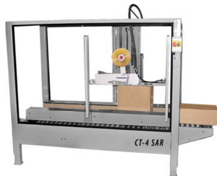
CT-4 SAR with full lexan guarding.