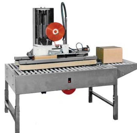
CT-4 SAR Semi Automatic Random Case Taper.

The CT-4 SAR is loaded with features including roller bed table, entrance and exit roller conveyors and casters, all standard. The CT-4 SAR heavy duty 2" tapehead boasts open faced tape threading for easy tape refill.